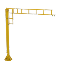
Freestanding Swing Arm