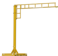
Portable Base Swing Arm