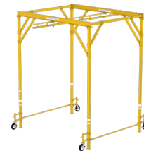
Portable Box Frame