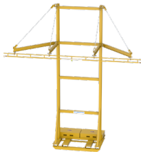
Griffin™ Skidded System

Our mobile fall protection systems offer convenient mobility and our reliable Anchor Track.