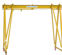
Rolling A-Frame (Fixed or Adjustable Height)