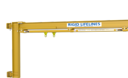
Column-Mounted Swing Arm