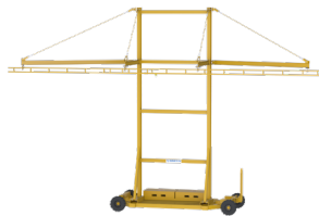
Griffin™ Wheeled System